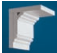
Different sizes of trimboards combined with bed mould and base cap present a stately, colonial feel.