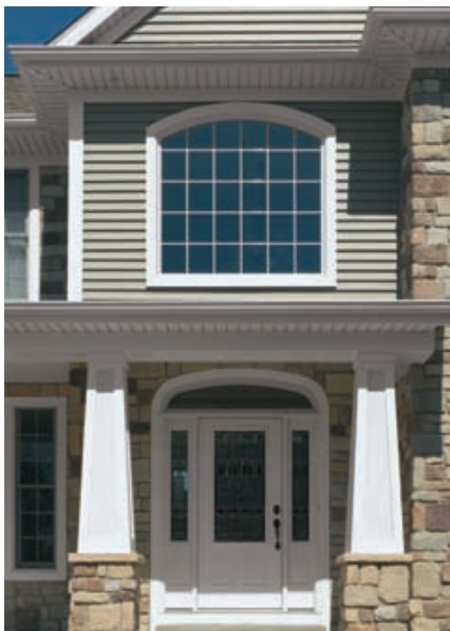
Trimboards, corners, heat-formed window application, and column-wrapped application with sheets

far—with no worries about rotting, warping, moisture or insects. As for designability, it's heat-formable for curves and arches, and a choice of Smooth or TrueTexture™ woodgrain finish offers even more options.