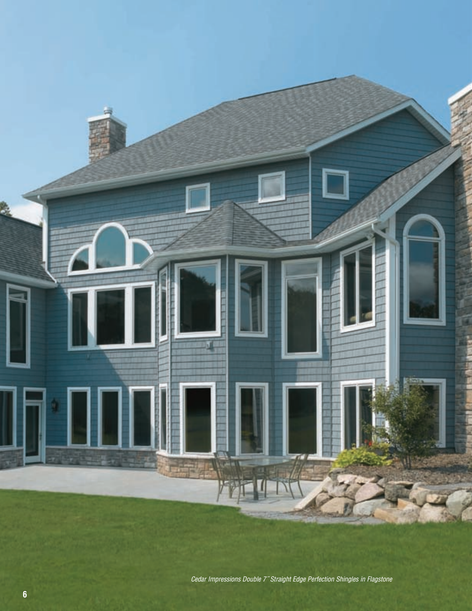
Cedar Impressions Double 7" Straight Edge Perfection Shingles in Flagstone