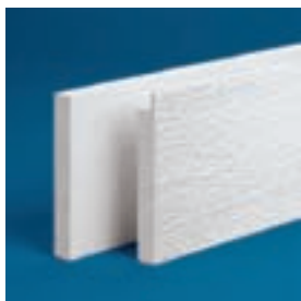
TRIMBOARDS REGULAR & J-POCKET SMOOTH/SMOOTH WOODGRAIN/SMOOTH

To what is already a comprehensive offering, we've made some notable additions: we now provide a 1-1/2" trimboard and corner with deeper pockets to accommodate siding with 1" projections, as well as smooth trimboards that are 16" wide .