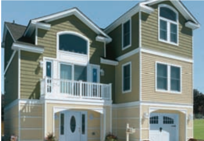
Restoration Millwork® shown with Cedar Impressions D7" Straight Edge Perfection Shingles in Cypress and Monogram D4" Clapboard in Desert Tan

Need more exterior design options? We certainly have them. CertainTeed, in fact, has the industry's broadest lineup of color and style choices in siding, including vinyl, polymer and fiber cement.