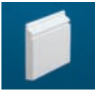
This trimboard accented with base cap shows no matter how simple the project, you can add detail and interest.

There's no limit to how Restoration Millwork profiles can be combined for unique looks.