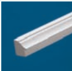
ADJUSTABLE BACK BAND