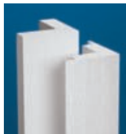
ONE-PIECE CORNERS REGULAR & J-POCKET SMOOTH WOODGRAIN