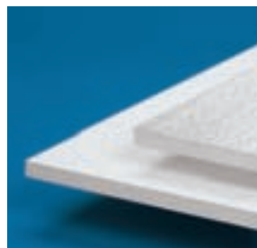
SHEETS SMOOTH/SMOOTH WOODGRAIN/SMOOTH