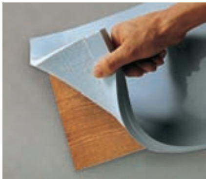
An impression from real cedar was applied to Restoration Millwork.