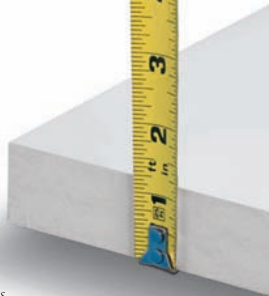
1-1/4" Actual Thickness