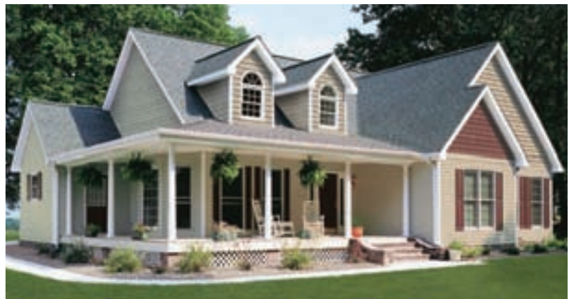
Monogram Double 5" Dutchlap in Savannah Wicker Northwoods Single 7" Straight Edge Rough-Split Shakes in Savannah Wicker and Barn Red