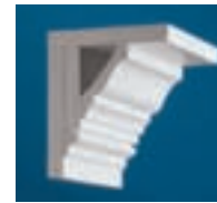
Even more intricate and ornate, use crown moulding and base cap to make a highly elegant statement.