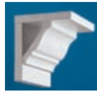
The use of crown moulding elevates any exterior trim application, creating a more formal look.