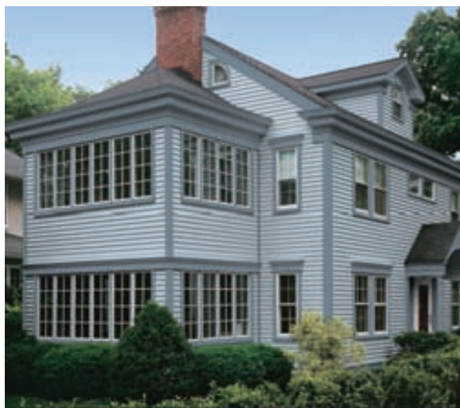
Painted Restoration Millwork with Monogram Double 4" Clapboard in Oxford Blue