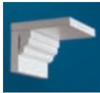
Dressing up cornice moulding can be as easy as detailing trimboards with rake.