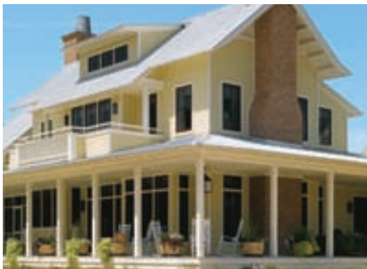
WeatherBoards FiberCement Smooth Lap Siding in Cream (custom color)