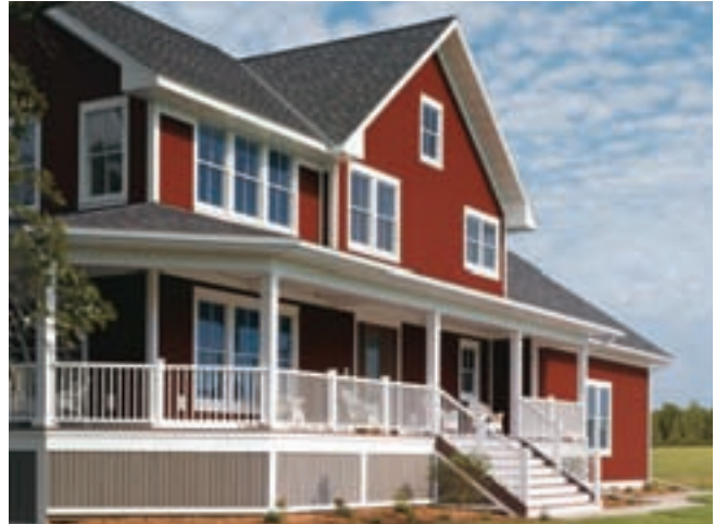
ColorMax Prefinished FiberCement Lap Siding in Autumn Red