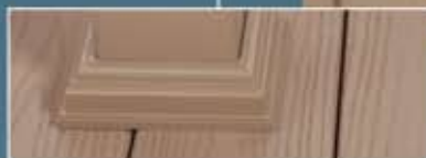
Royal Outdoor offers railings in matching colors to add the perfect finishing touch to your Novation deck.

You can see the difference when you compare Novation to other decking products. With Novation, you get pure, solid construction. However, wood and standard composite decking contain fillers that can absorb moisture and become weakened over time.